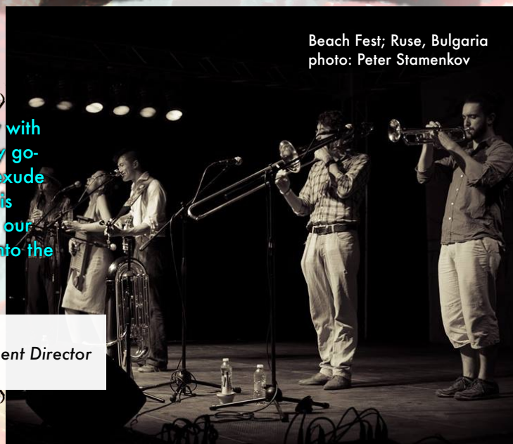
Beach Fest; Ruse, Bulgaria